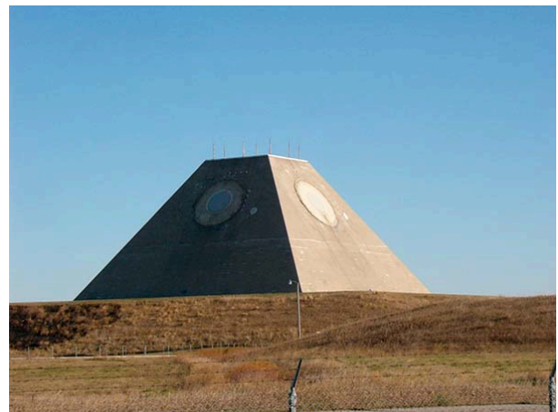
A Safeguard Missile Site Radar, built to defend US missile bases.