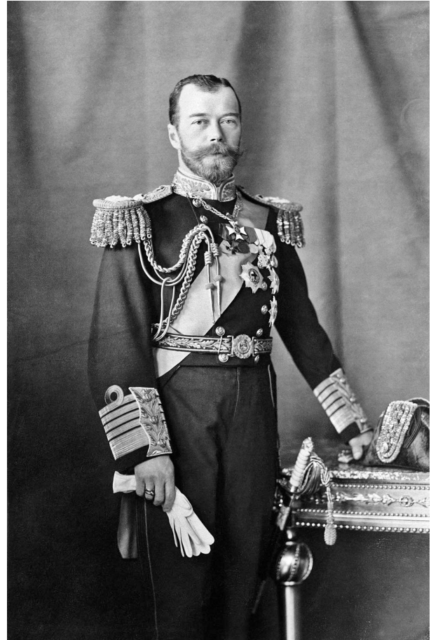
Tsar Nicholas II of Russia initiated the Hague Peace Conference of 1899.

The conference led to the signing of the Hague Convention of 1899. This Convention consisted of three main treaties and three additional declarations, which together established rules for declaring and conducting warfare as well as the use of modern weaponry and set up the Permanent Court of Arbitration