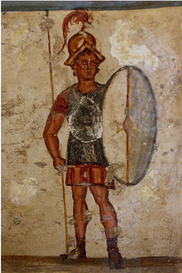
Fresco of an ancient Macedonian Greek heavy infantry soldier wearing mail armour, 3rd century BC.

Istanbul Archeology Museums (CC BY-SA 4.0)