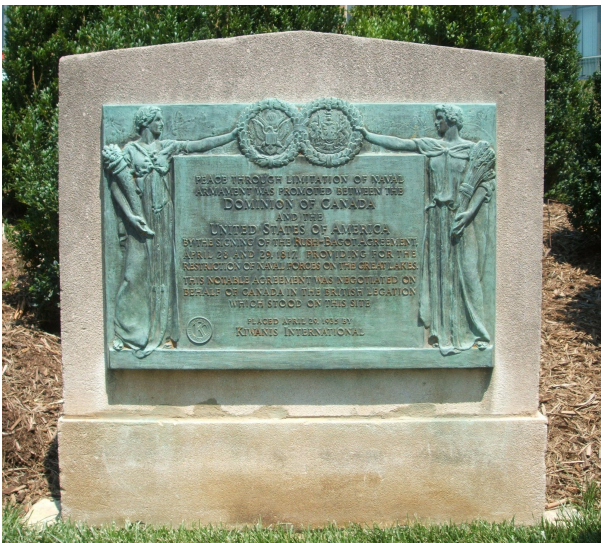
Historical marker for the Rush-Bagot Treaty in Washington, D.C., where the Rush-Bagot Agreement was negotiated.

The agreement between the US and Great Britain led to the naval demilitarisation of the Great Lakes and Lake Champlain region of North America. Under the Agreement, each side was permitted to deploy a maximum of one ship on Lake Ontario, two ships on the Upper Lakes and one on Lake Champlain, and none could exceed one hundred tons and one eighteen-pound cannon.