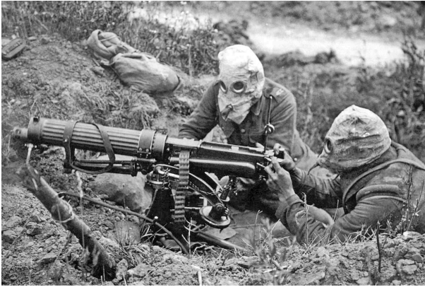
A British machine gun team wears anti-gas helmets in WWI.

and technological innovations in the field of infantry and artillery had been decisive factors in the outbreak and longevity of hostilities.