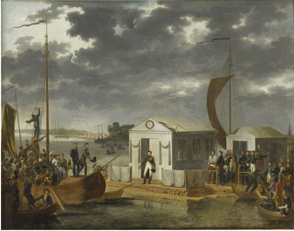
Meeting of the Napoleon I of France and Alexander I of Russia in a pavilion set up on a raft in the middle of the Neman River. Adolphe Roehn (Public domain)

In 1808, two Franco-Prussian Treaties (also known as the Treaties of Tilsit) were signed, by which the Prussian army was limited to 42,000 troops for a period of 10 years from 1 January 1809 and Prussia was stripped of about half its territory.