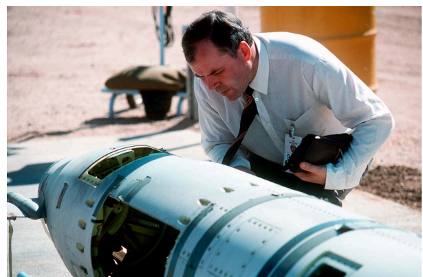
A Soviet inspector examines a BGM-109G Tomahawk ground launched cruise missile (GLCM) prior to its destruction.

In the second case, along with the Conventional Forces Europe Treaty (CFE; 1990) and the Vienna Document (VD; 1990, updated in 2011), the Open Skies Treaty (OST, 1992) constituted a mutual reinforcing framework of arms control and confidence and security building measures (CSBMs) in Europe.