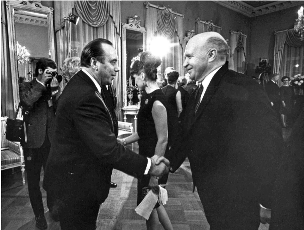
The Finnish foreign minister Väinö Leskinen and the Soviet diplomat Vladimir Semyonovich Semyonov shake hands at the SALT I negotiations in Helsinki. The negotiations lasted from 1969 to 1972.

After the US had proposed to the USSR to launch negotiations on the prohibition of ballistic missile defences in 1966, the Strategic Arms Limitation Talks (SALT) between the US and the USSR started in 1969 (Helsinki, Finland). Part of this first SALT process were formal negotiations of an ABM Treaty.