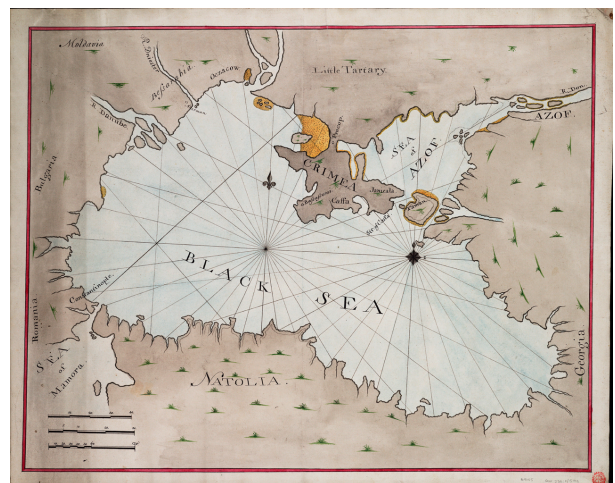
An early 19th century map of the Black Sea. National Maritime Museum, Greenwich, London

The treaty made the Black Sea neutral territory, closed it to all warships and prohibited fortifications and the presence of armaments on its shores.