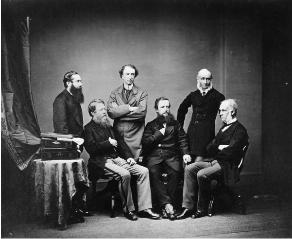
The British High Commissioners for the Treaty of Washington group for a picture.

The treaty between Great Britain and the US, leading to total demilitarisation and inaugurating permanent peaceful relations between the US and Canada, and the US and Britain.