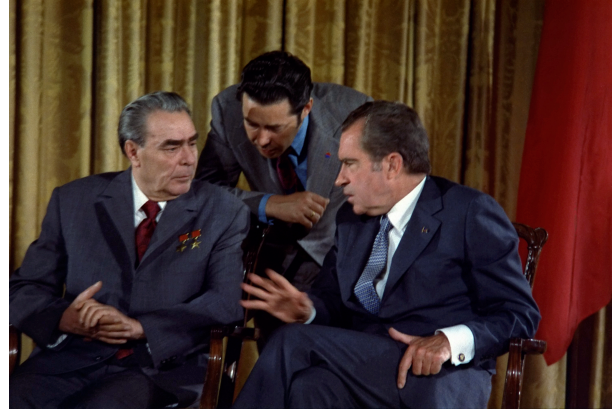
US President Richard Nixon and Soviet General Secretary Leonid Brezhnev – still in a good mood in 1973.

[ https://web.archive.org/web/20140502005429/http://cns.miis.edu/inventory/pdfs/aptsaltI.pdf ] is signed for a period of five years.